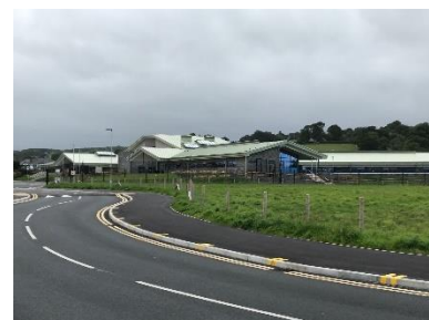
Ysgol Pen Barras and Rhos Street School relocated to the Glasdir site in April 2018