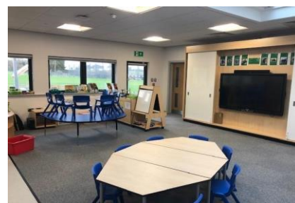
Ysgol Llanfair DC opened in February 2020